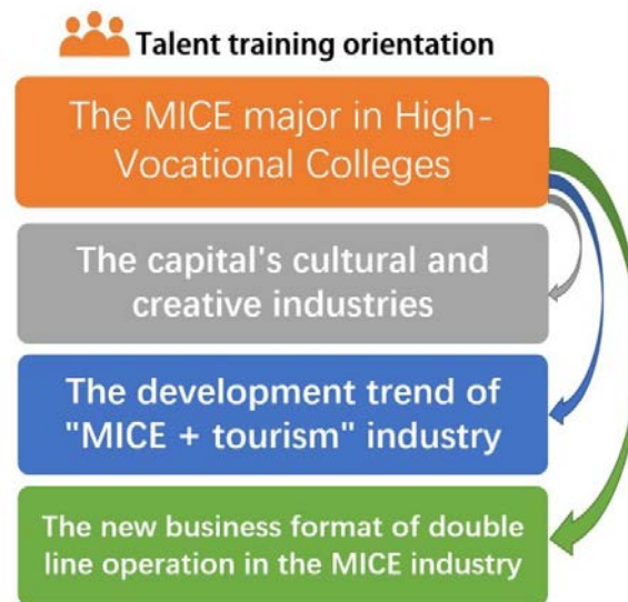
Fig.1 The MICE major in High-Vocational Colleges adjusts the orientation of talent training with the new changes of MICE industry.

With the rapid development of big data and the digital economy, the new technology of online MICE has also been widely applied in the MICE industry. Especially since the outbreak of COVID-19, the dual line MICE and operation mode has become the format of the MICE industry to deal with the new situation. This also puts forward conceptual changes and technical requirements for the MICE industry. In such a new media era, the MICE industry should make full use of modern information technologies such as Internet, big data, artificial intelligence and new media, and combine online and offline to realize the integration of Online MICE + Real MICE. This requires the training of the MICE major in High-Vocational Colleges to face the new format of the MICE industry.